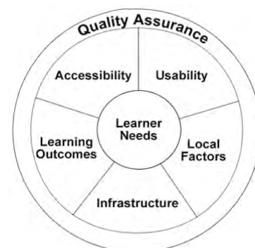
Figure 1: Holistic Framework For E-Learning Accessibility

As well as the flaws in the WAI model, the WCAG guidelines themselves are flawed. Kelly et al (Kelly, 2004) have argued that the poor level of compliance with WCAG guidelines which has been observed in many sectors (including higher education, museums and even disability organisations themselves) reflects, not necessarily a lack of motivation to support users with disabilities but rather a failing in the guidelines themselves. In the light of these issues the authors feel that a slavish commitment to WAI guidelines is inappropriate and that an alternative approach is needed. A holistic framework for e-learning accessibility has been developed by Kelly et al (2004) which takes a user-focused approach to Web accessibility, rather than the conventional checklist approach. This framework is illustrated in Figure 1.