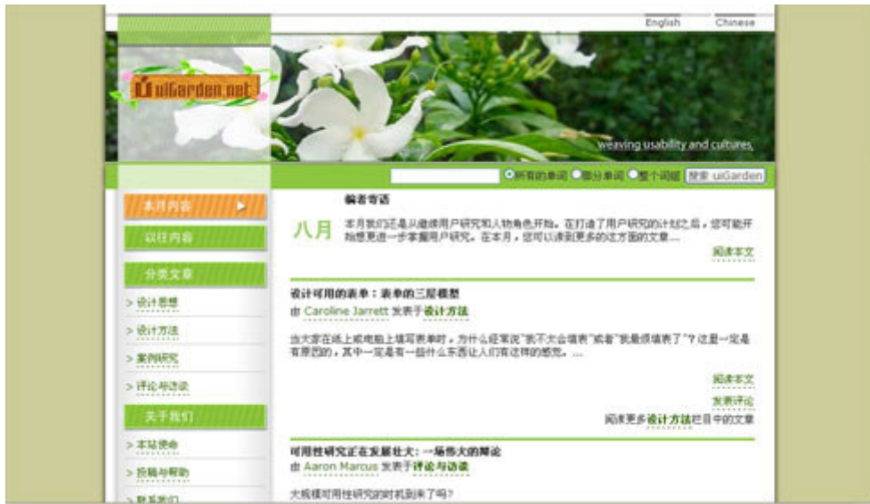
Figure 3. The webzine in Chinese