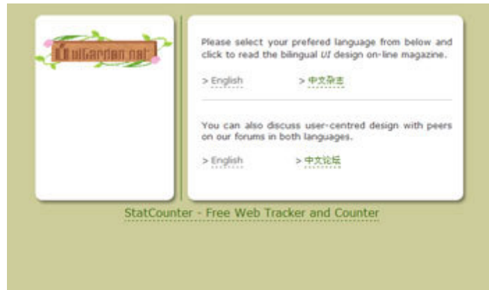
Figure 1. The portal page to get into the site with different languages