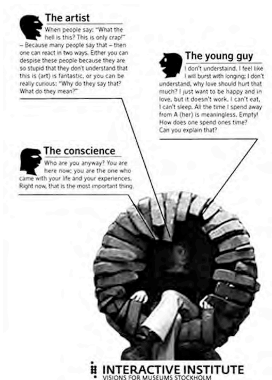
Figure 1. Access in Mind and example of the voice collage.

which are engaged in a kind of ongoing discussion based on their respective views. The first voice alludes to that of a learned or authoritarian speaker; in this case the artist or art connoisseur – the expert’s voice. The second voice is of a fictitious young man reflecting on love, loneliness, insecurity, suicide and everyday life. The third and last voice belongs to a young woman, a kind of conscience that appears behind the visitor’s neck and encourages the visitor to feel free to grasp without restraint; not to be afraid and to believe in their experience and judgement (fig. 1).